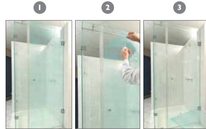
PROTECTAPEEL applied to shower glass.